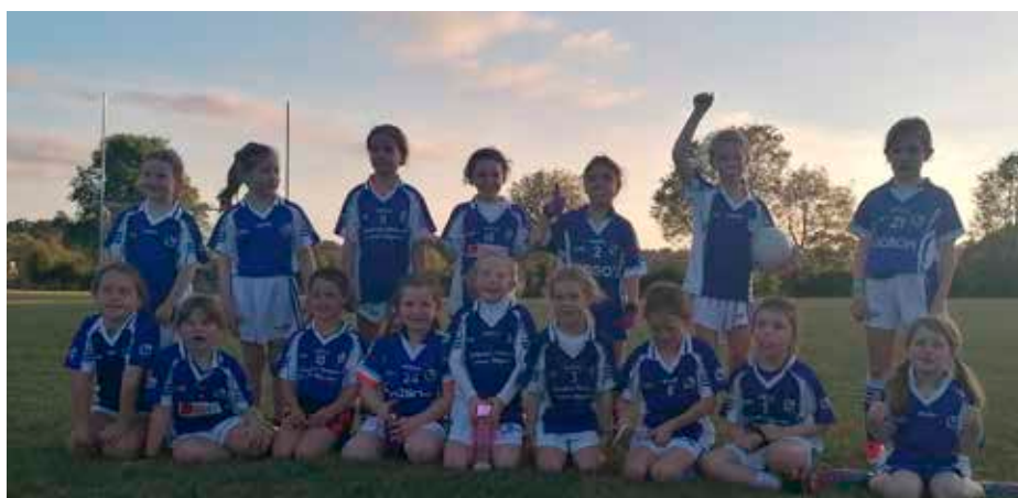
Our U8 girls had their first game this week against Dunsany. Great skills on show and brilliant fun had by all.

Thursday 08th September: Rathkenny 2-07, Skryne 2-08