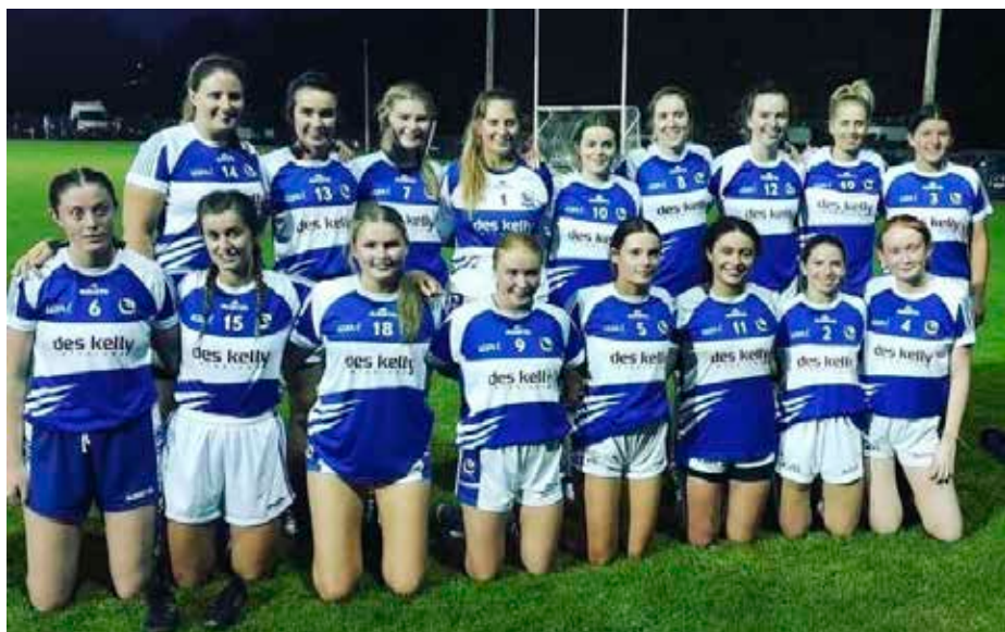
Junior D Team

Not to be outdone, our Junior D Ladies also booked themselves a semi-final spot in the Junior D championship after they beat a very strong Rathkenny team by just a single point. It was another 'never over til it's over' performance by the girls as they made it three wins out of three in Group 2.