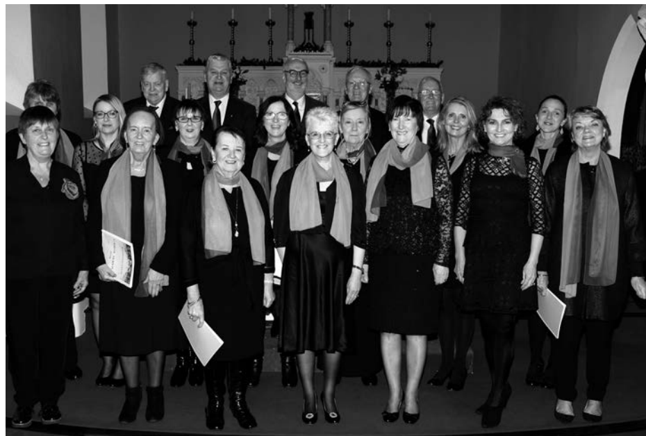
Rathfeigh Church Choir who performed their Annual Carol Service in Rathfeigh Church on 15th December