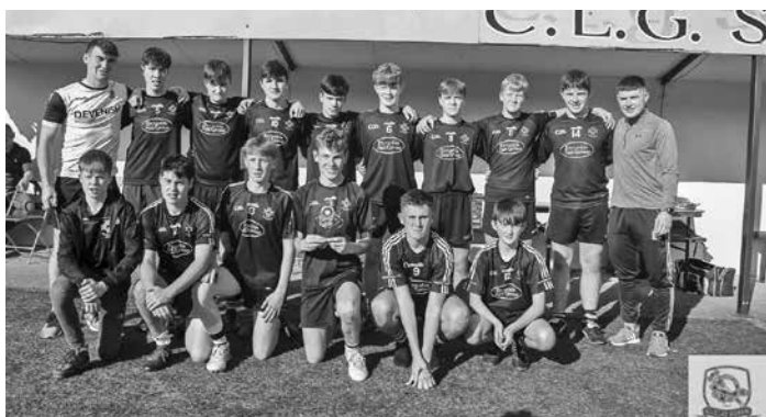
Walterstown - winners of the Cup