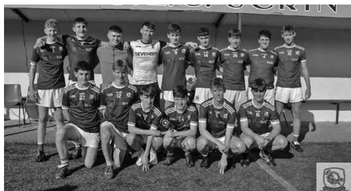
Skryne - winners of the Shield