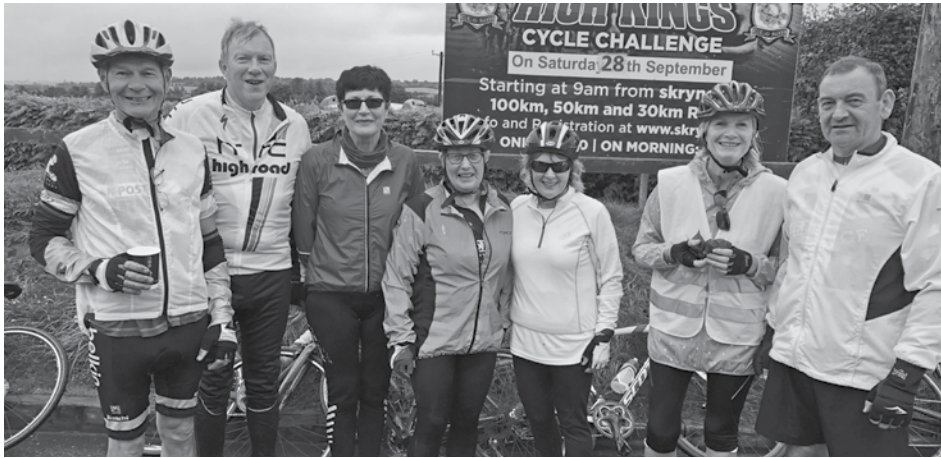
Beginner Cycling Group out in force at the Skryne GAA Cycle.