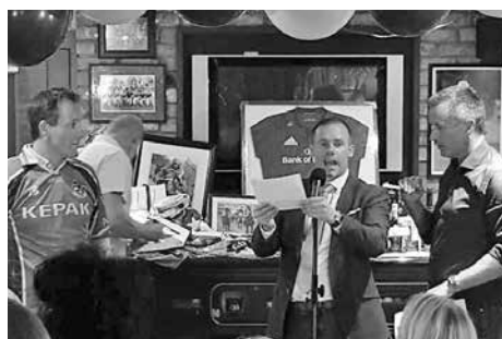
Auction at Fox's