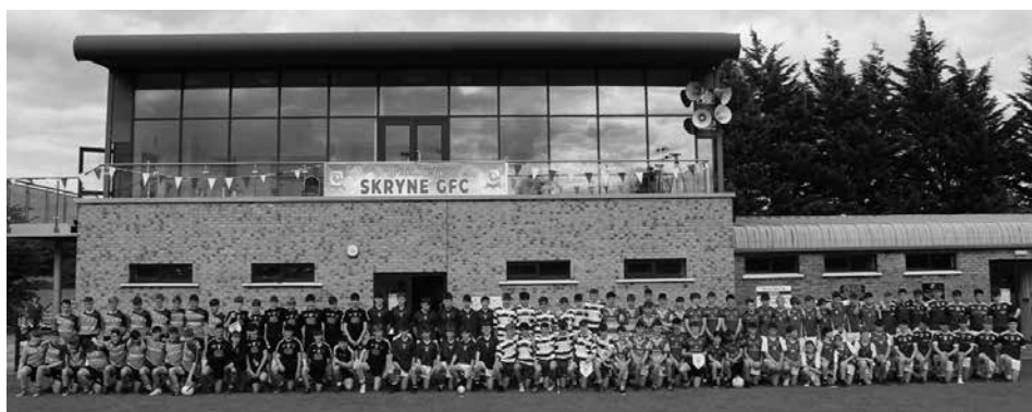
All of the teams that took part in the U15 Blitz