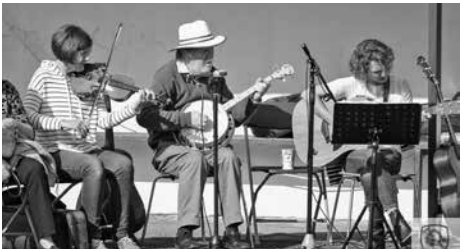
Our Wonderful Musicians