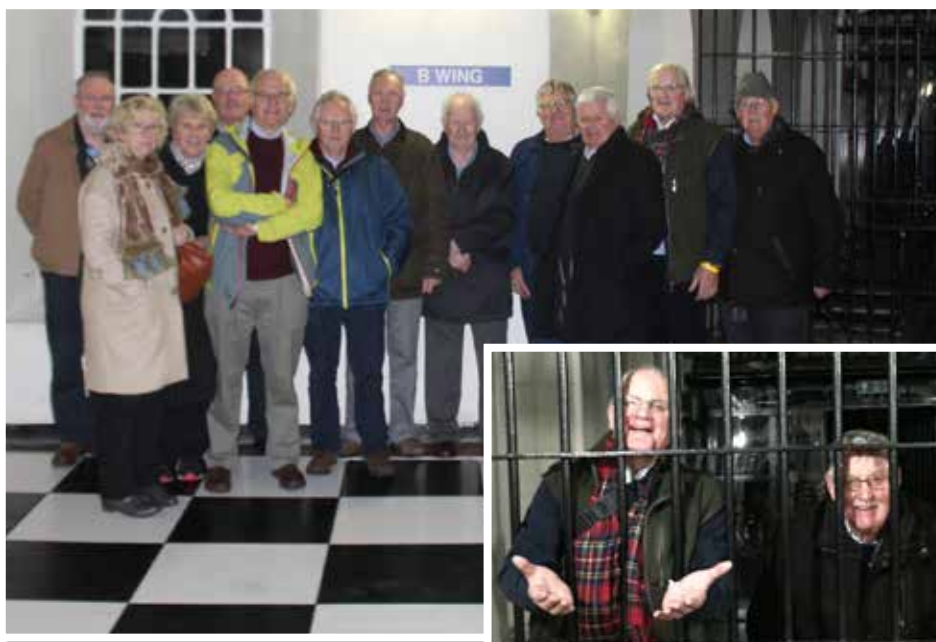
Members of the Tuesday Club in Crumlin Road Gaol. All released without bail!