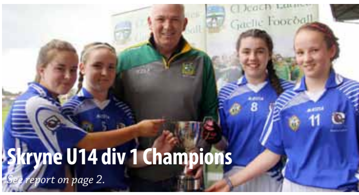
Skryne U14 div 1 Champions See report on page 2.