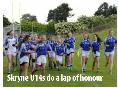
Skryne U14s do a lap of honour

Scoil Cholmcille make history winning both boys & girls Cumann na mBunscol finals.