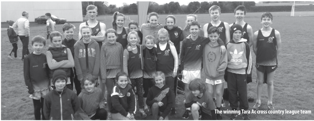
The winning Tara Ac cross country league team