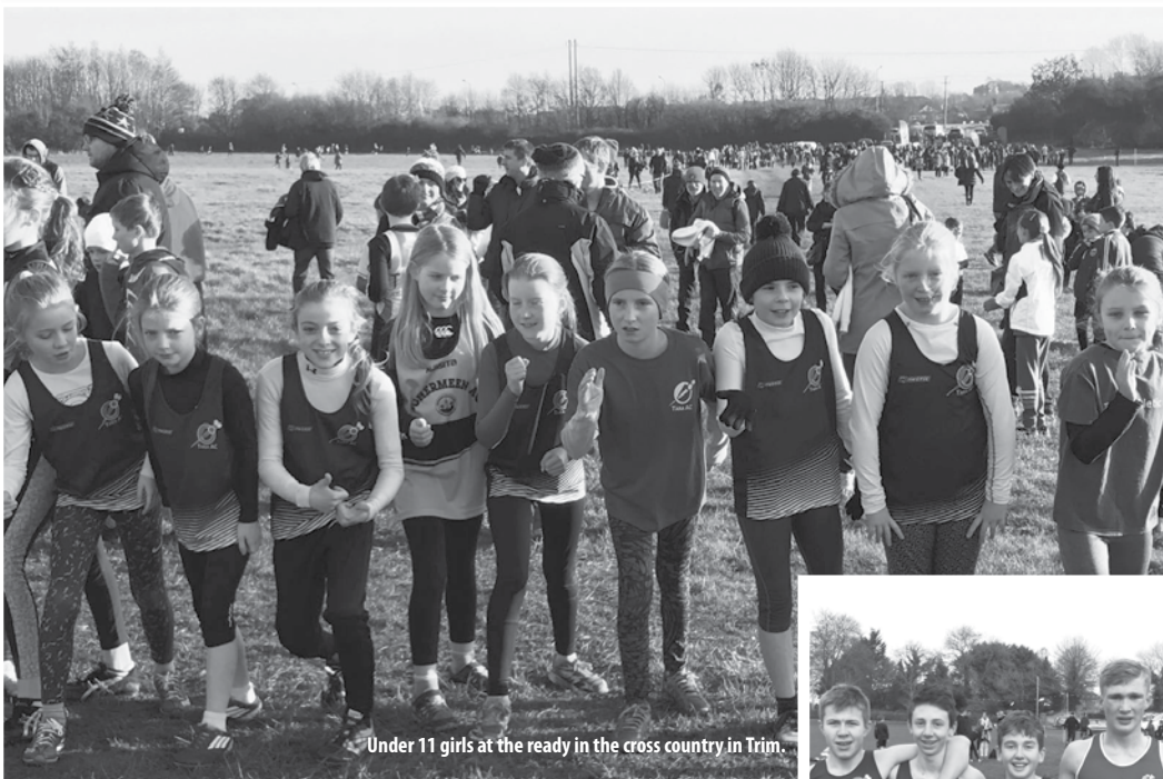
Under 11 girls at the ready in the cross country in Trim.