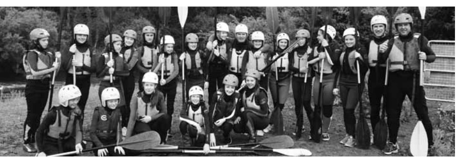
The coaches brought the girls out for a team building day after the final. The kayaking was the highlight. U14s on the Boyne, practicing blanket defence