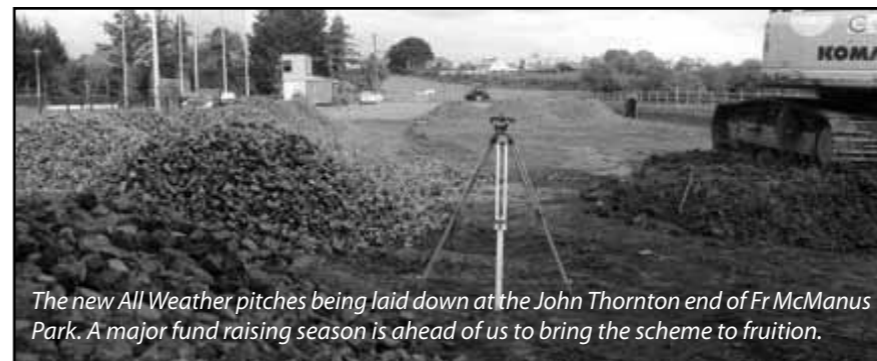
The new All Weather pitches being laid down at the John Thornton end of Fr McManus Park. A major fund raising season is ahead of us to bring the scheme to fruition.