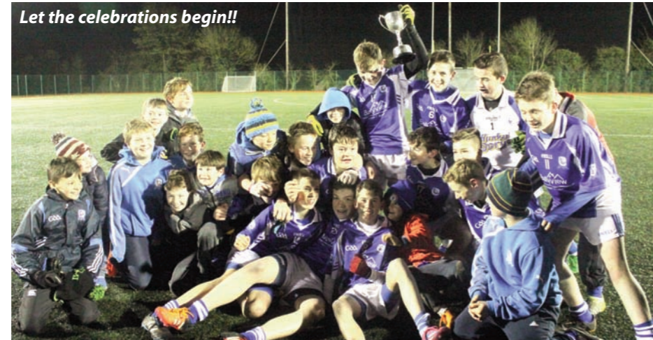
Let the celebrations begin!!