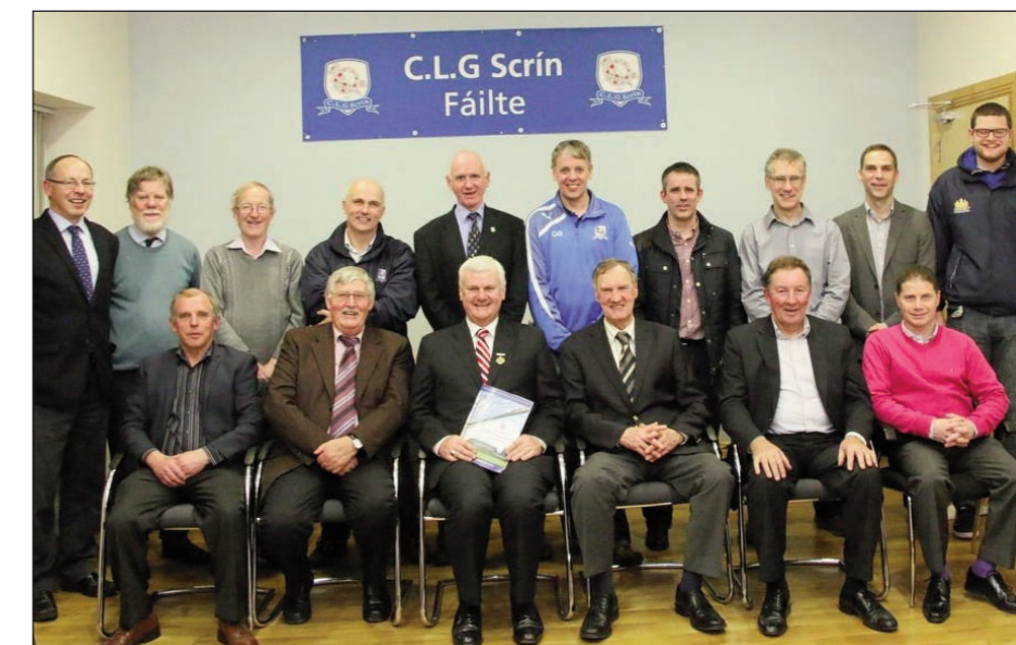
The President with Officers and Committee of Skryne GFC