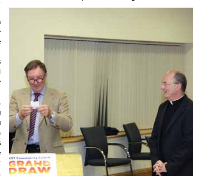
And the winner is