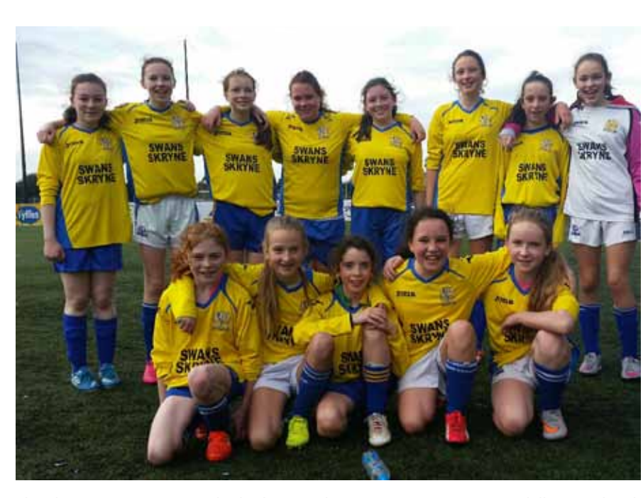
The Skryne Tara u14 team who had an emphatic 2 – 0 victory over Dundalk in Oriel Park and are currently battling it out with Cavan & Parkvilla at the top of the NECSL league.