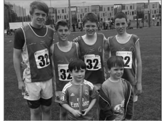
Under 14 Relay