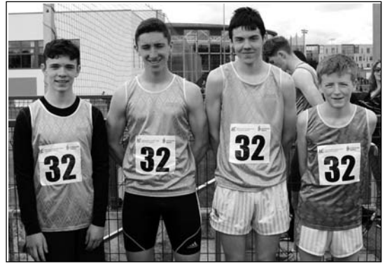
Under 16 relay Team