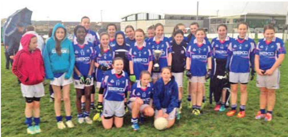
Under 13 Girls Panel