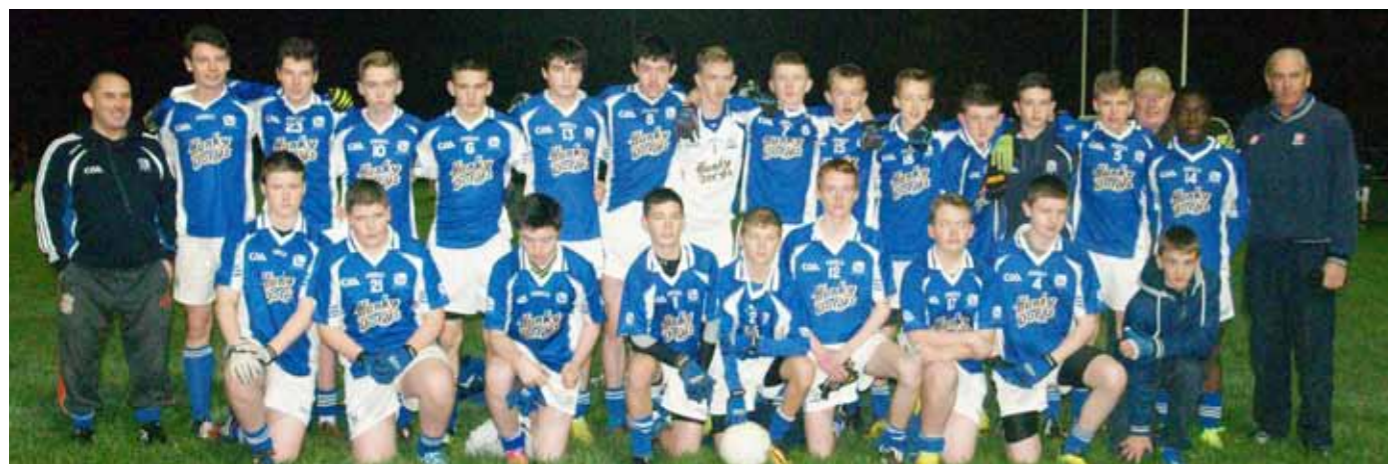
The Under 15 Panel