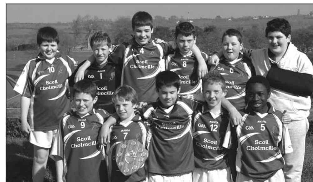
Senior Boys Handball who won their Shield competition recently in Claremont