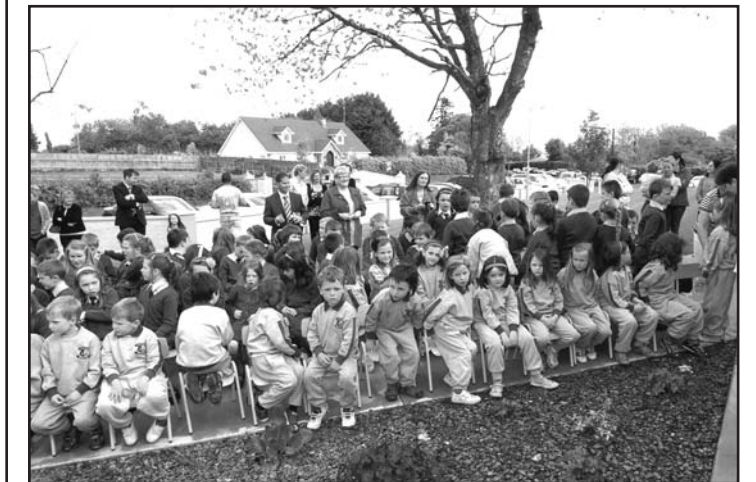
Awaiting the arrival of the Bishop