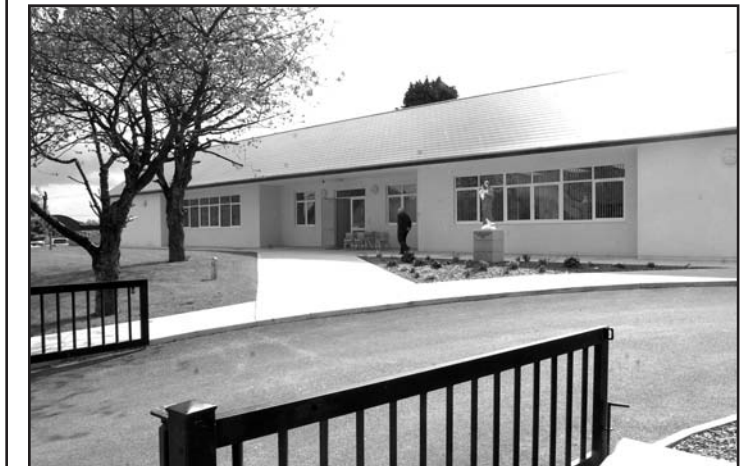
The new school

The school was looking exceptionally well and visitors were able to tour the building and grounds afterwards. The general opinion was that the extension was an excellent job and the people of Rathfeigh are rightly proud of their new school.