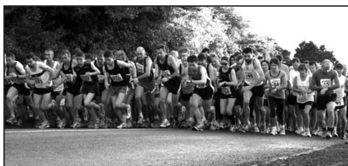
Start line of Tara AC 5K 2010