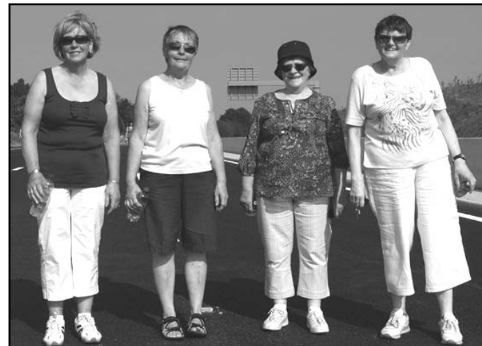
Killinaskully Walking Group