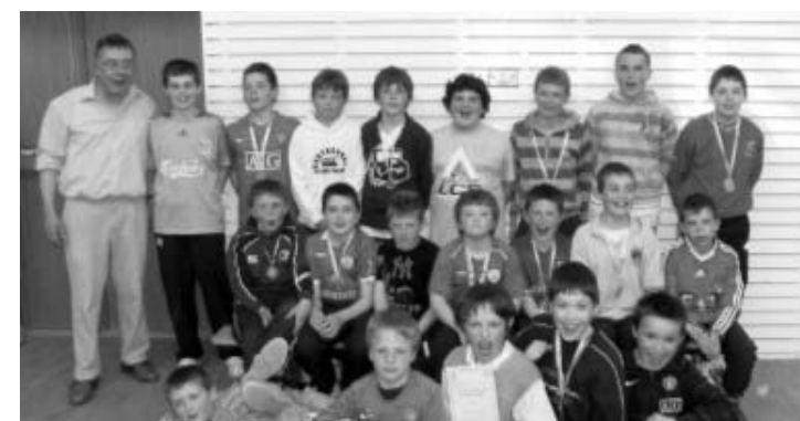
Meath Community Games Champions 2008/2009