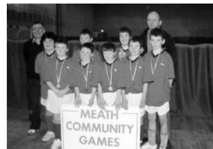
The Skryne Rathfeigh team who won the Meath Community Games U13 Indoor Soccer Championship in Gormanstown College.