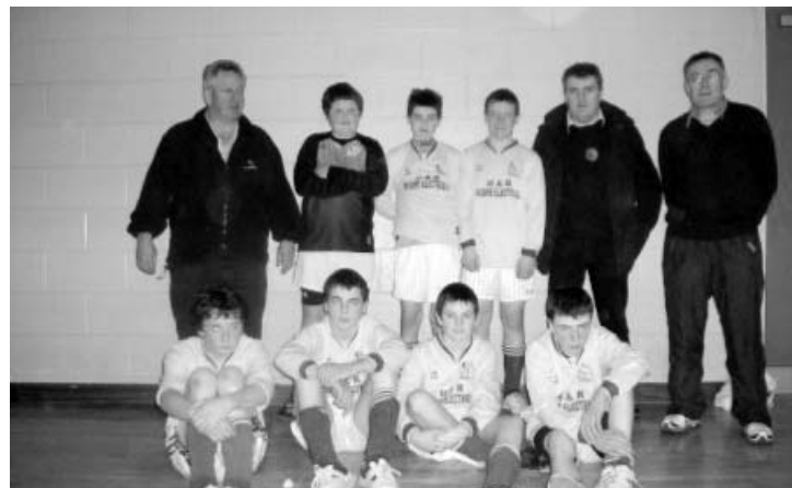
The Skryne Rathfeigh team who were runners up in the final of the Meath Community Games U15 Indoor Soccer Championship in Gormanstown College.