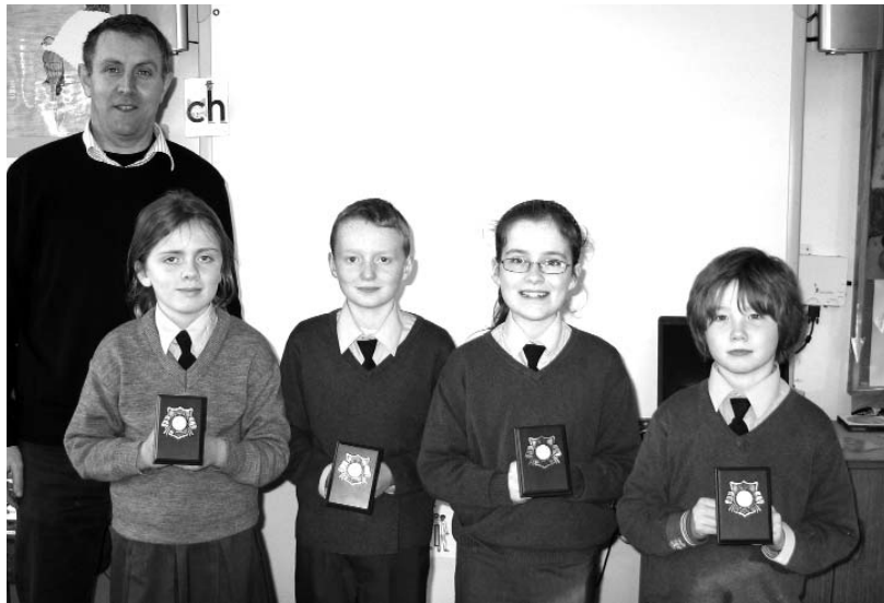
Rathfeigh N.S. - winners of U11 Credit Union Quiz