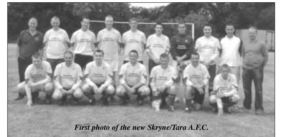
First photo of the new Skryne/Tara A.F.C.

This Issue is Sponsored by: RONALD DUFF & ASSOCIATES