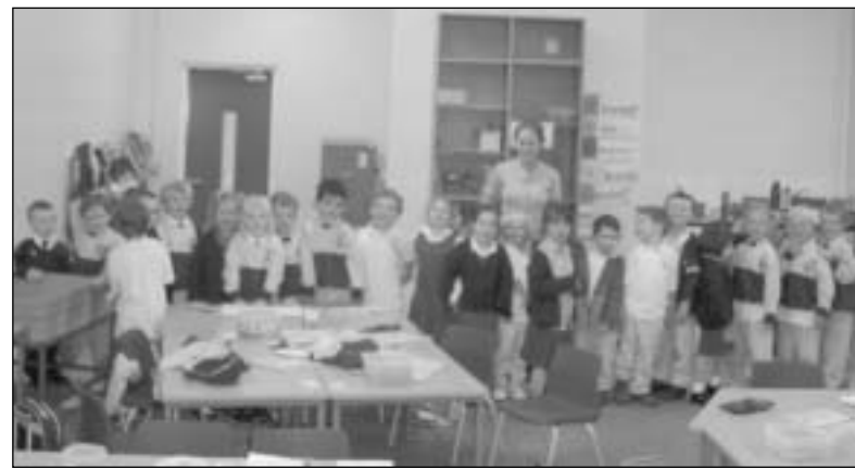
Junior Infants, Skryne National School