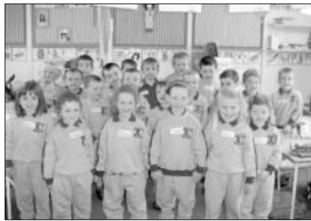
Junior and Senior Infants, Rathfeigh National School