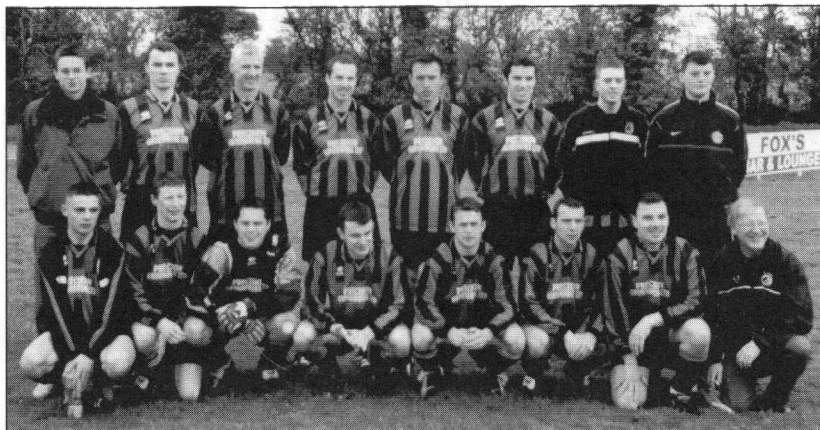
TARA 1st Team Div. 2 Runners-up