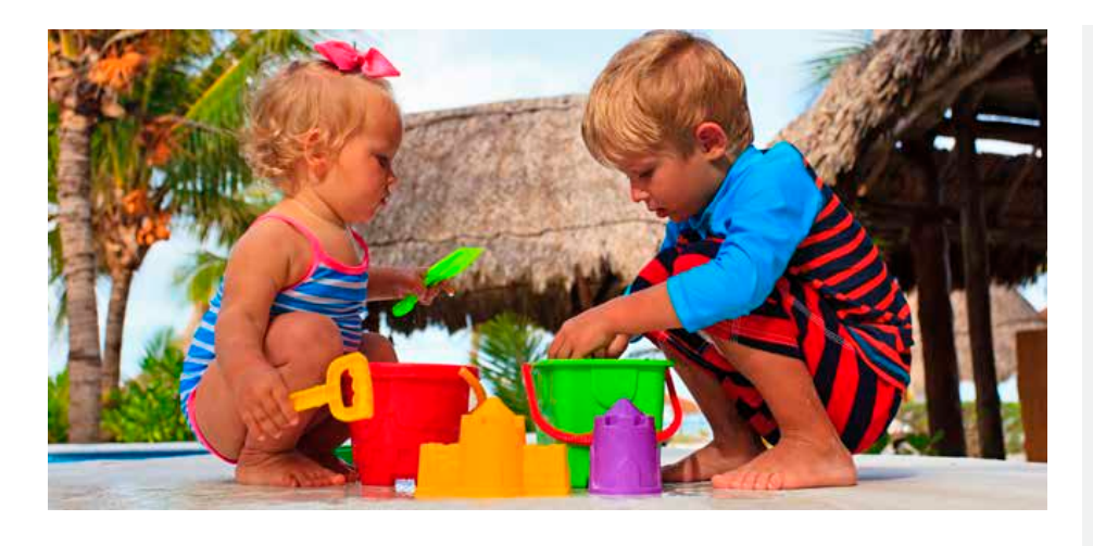
Find the 8 differences hidden in these two seemingly identical pictures