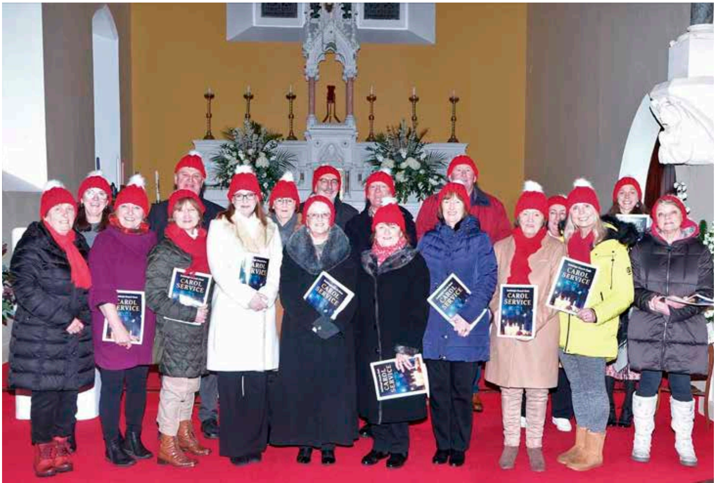
Rathfeigh Choir pictured in Rathfeigh Church prior to their outdoor carol service on Sunday 19th December 2021.